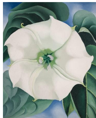
Georgia O'Keeffe Jimson Weed/White Flower No. 1 1932

People can express themselves in different ways in art. The way artists create art allows them to show emotions through colours and shapes. Different people can think about art in different ways and don't always like the same pieces of art. When artists think about how to make their pieces, the way they want to express themselves means they might choose different media/mediums. The way an artist chooses to express themselves is a personal choice - there is no wrong way.