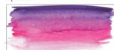
Wet on wet